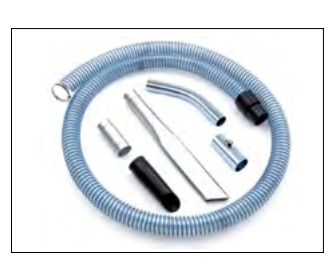
Optional accessory kit for fluid and swarf cleaner.